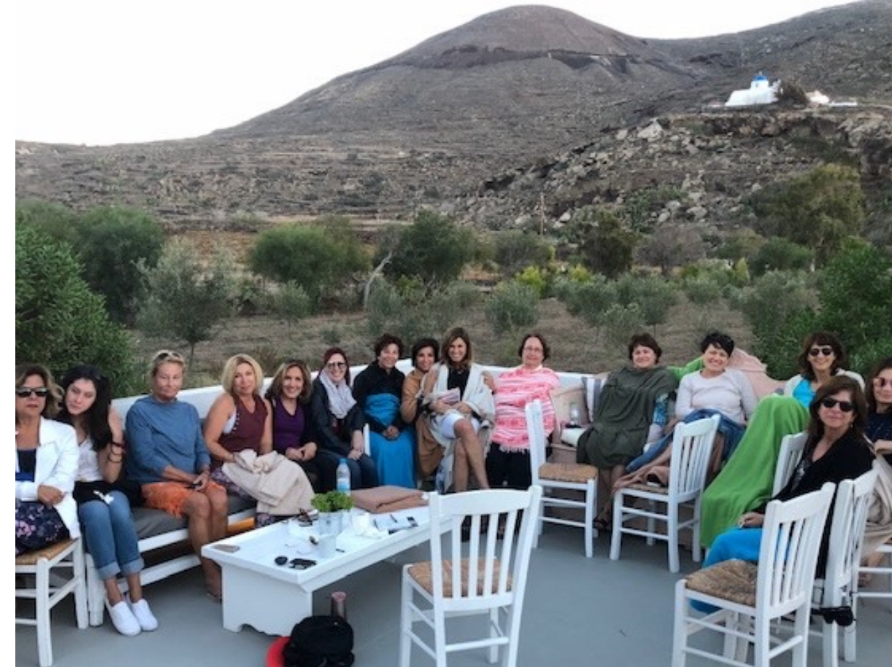
RETREATS DOMESTIC & INTERNATIONAL